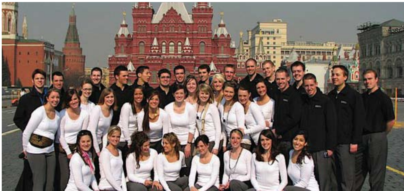
First day in Russia, Dance Alliance visits Red Square in Moscow.

BYU–Idaho’s Dance Alliance performance group brought a spiritual message of hope to nearly 6,000 people during a multi-city tour of Russia April 11-29.