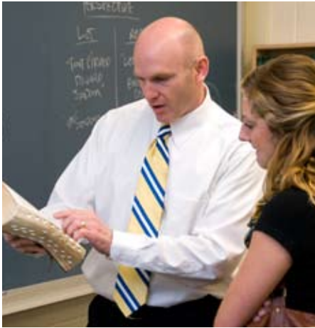
Brother Allred discusses a scripture with student.

This is the last article in the Spotlight on Learning series. This series focuses on faculty members recommended for implementing the Learning Model in effective and creative ways.